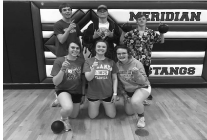
2020 Dodgeball Champions: The Crips

This past month has been a whirlwind, to say the least. Student Council hosted its Annual Dodgeball Tournament on March 6th. Thank you to all fourteen teams for participating! Congratulations to The