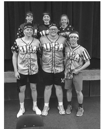
2020 Best Team Costume: The Ram Chargers